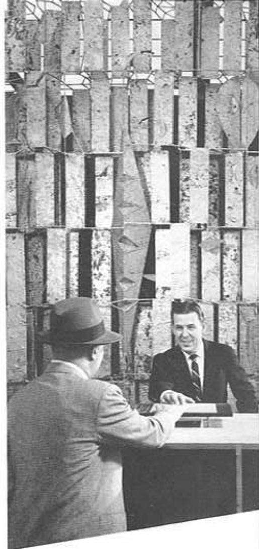
Every customer convenience and comfort amidst stimulating and friendly surroundings is provided for in the Fifth Avenue Office.

The efforts of Manufacturers Trust Company to build a better place for the public to bank were paralleled by its desires for a better place for its employees to work. Our 150 employees benefit