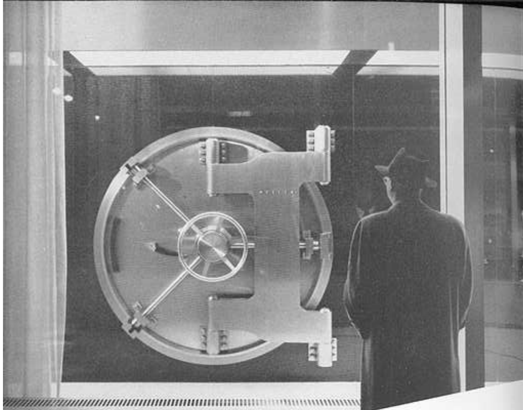
The main vault with its decorative door is located on the first floor in full view of eight million New Yorkers.

phasized. Every technique of construction, lighting and design has been employed to contribute to a comfortable, inviting and efficient interior—designed, throughout, to serve you better.