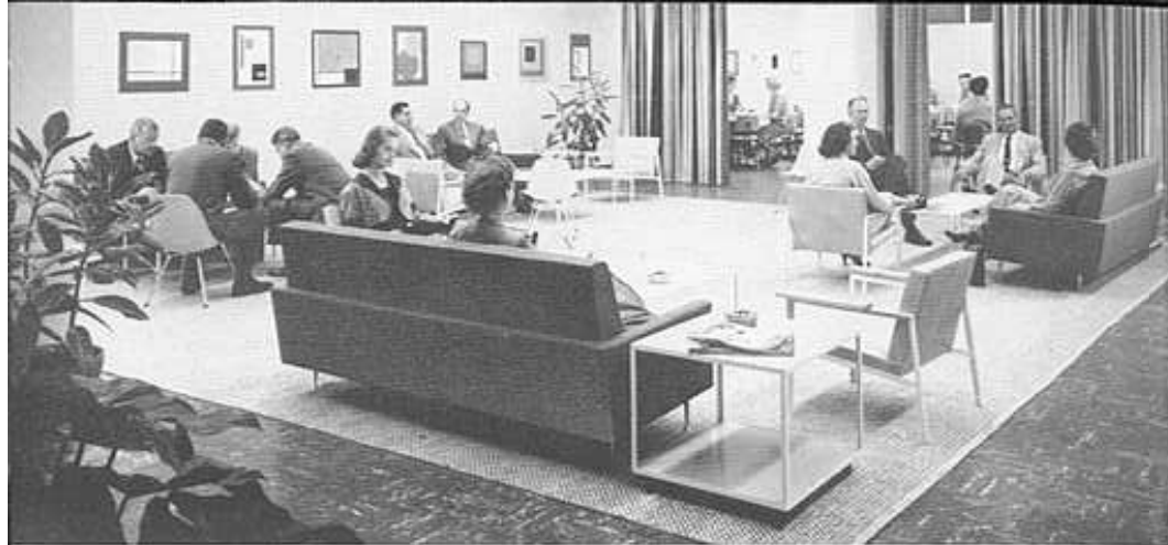
Working conditions for bank employees are enhanced by the facilities of a recreation room, lounge and lunch room.

by spacious working conditions, year-around air-conditioning, and color arrangements and lighting systems designed to rest the eyes. For their convenience, the building contains a lunch room, lounge and recreation area, all attractively decorated.