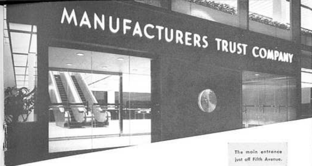
The main entrance just off Fifth Avenue.

W ELCOME to the Fifth Avenue office of Manufacturers Trust Company located in the heart of the Grand Central area!