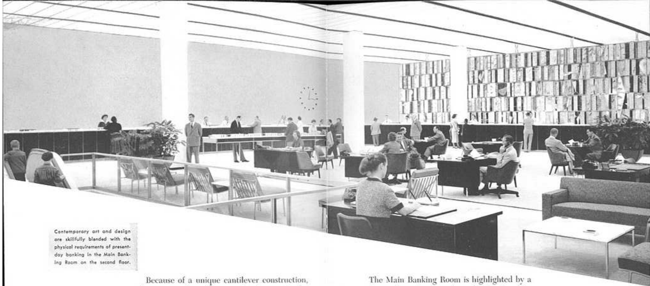
Contemporary art and design are skillfully blended with the physical requirements of present-day banking in the Main Banking Room on the second floor.

Because of a unique cantilever construction, there are only eight exposed columns in the Main Banking Room on the second floor. The building's glass walls support no weight, but hang like curtains. The floor is set back, mezzanine-fashion, some eight feet from these walls, thus there is a 32 foot expanse of glass reaching from ground level to the third floor. The largest panes are one-half inch thick, measure 22 by 10 feet and weigh 1,500 pounds. They are the biggest sheets of glass ever installed in a building in this country and posed challenging transportation and installation problems. Sealed in place, the glass insulates customers and employees from street noises and helps control the purity, humidity and temperature of the air.