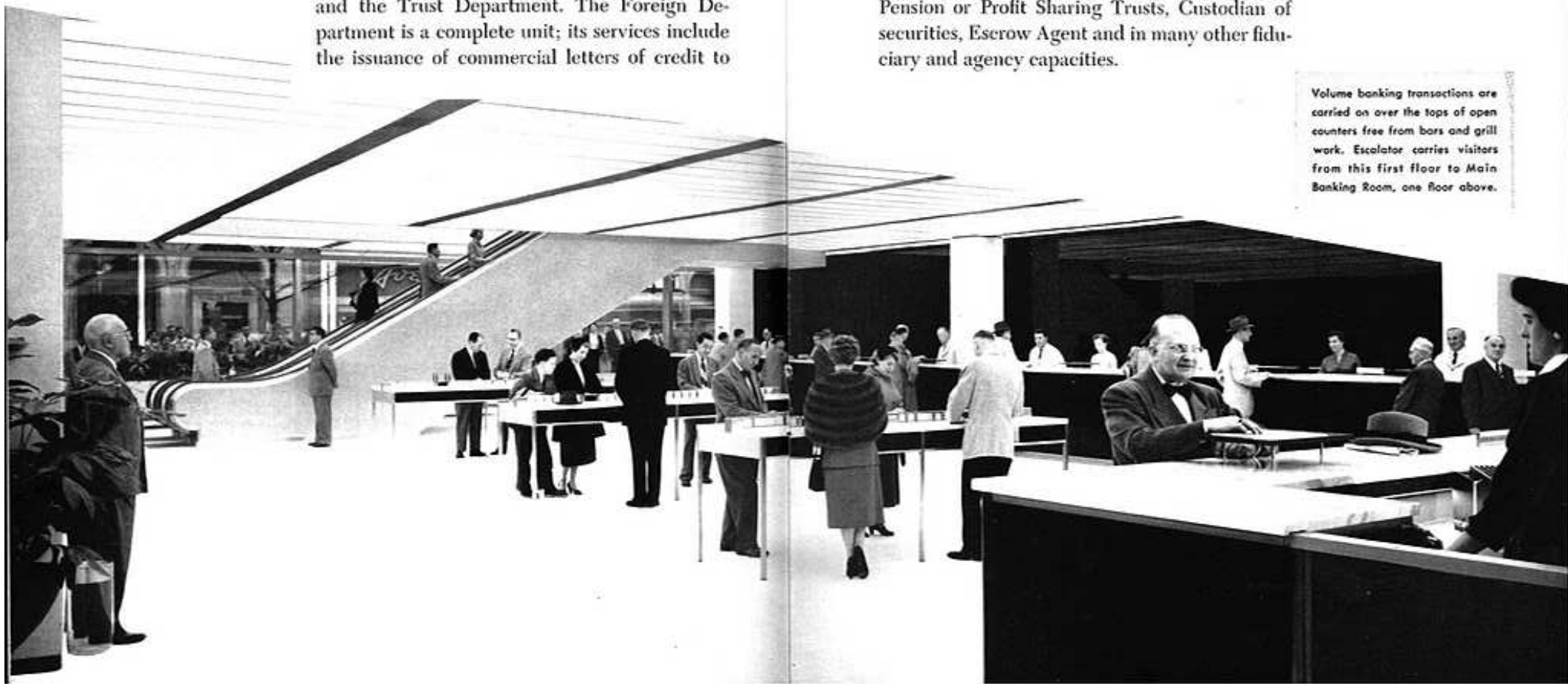
Volume banking transactions are carried on over the tops of open counters free from bars and grill work. Escalator carries visitors from this first floor to Main Banking Room, one floor above.

Also on this floor are areas for senior officers and representatives of the Foreign Department and the Trust Department. The Foreign Department is a complete unit; its services include the issuance of commercial letters of credit to